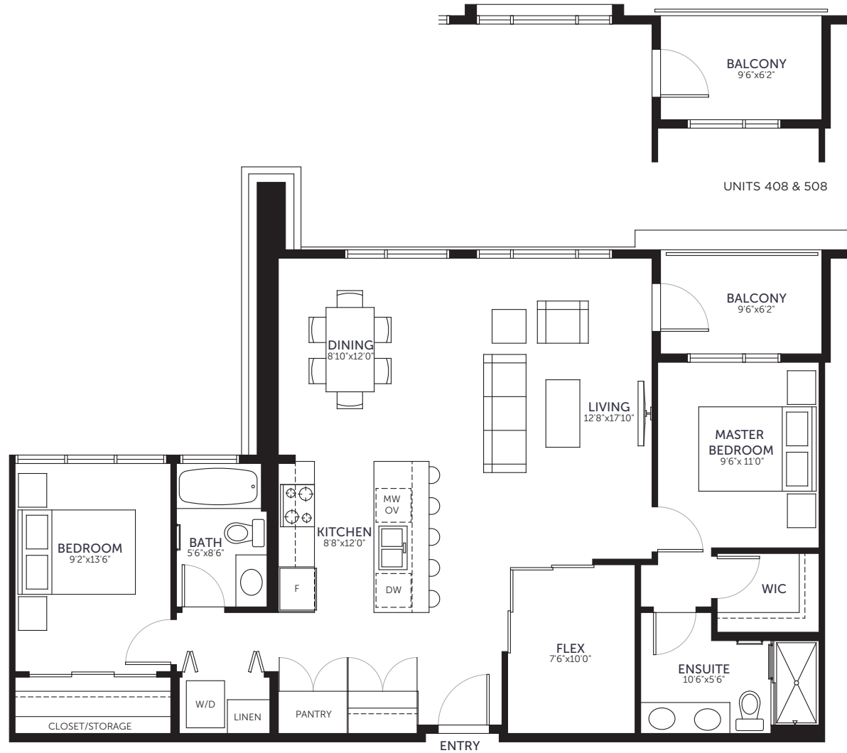
UNITS 408 & 508